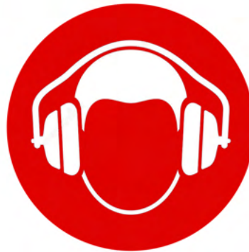
WEAR HEARING PROTECTION