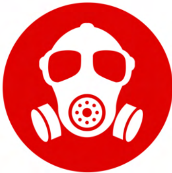
WEAR RESPIRATORY PROTECTION