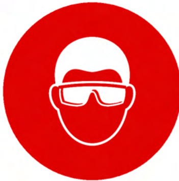
WEAR EYE PROTECTION